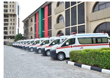
1. Adamawa 2.Delta 3.Borno 4.Enugu 5.Imo 6.Jigawa 7.Kaduna 8. Kwara 9.Plateau 10. Sokoto 11.Ondo